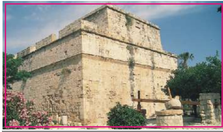
The Medieval Castle of Limassol

When the Ottoman Turks invaded, in 1570, the island was taken over with little resistance. Limassol was conquered in 1570 and pillaged and burned to the ground once more. Travelers' accounts from those times describe Limassol as a large settlement with a significant population. Christians lived in small homes with low doors that people had to stoop to go through, so that the Ottoman cavalry could not enter their homes.